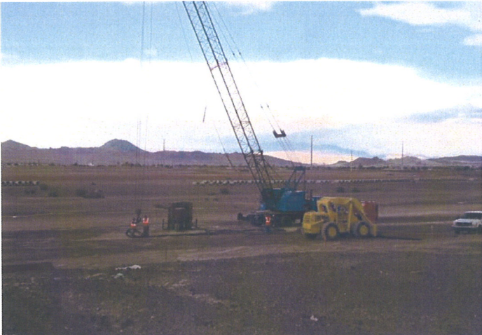
CAMU: Sheetpile crane mobilized and erecting.