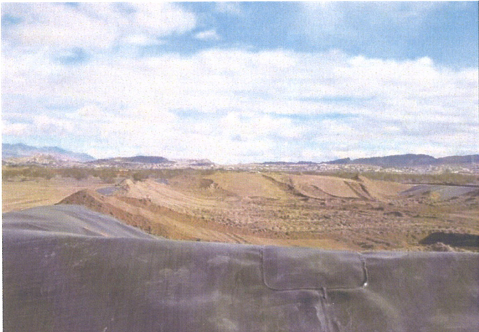
Eastside: Debris storage area, ops layer being placed.