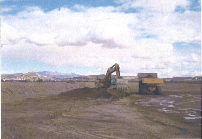
Eastside: PUC-4 excavation