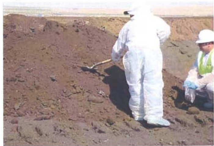
Eastside: Geosyntec and Entact sampling soils on HP-3.