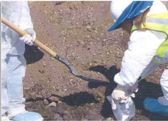
Eastside: Geosyntec and Weston Sampling soils on HP-3 stockpile