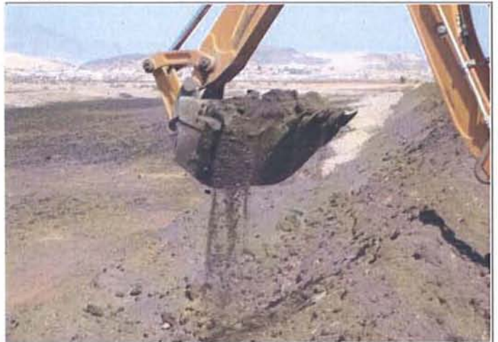
Eastside, Geosyntec and Weston sampling on HP-3 stockpile.