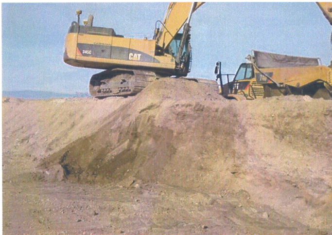
Eastside: PUC-3, Remediating Northern berm.