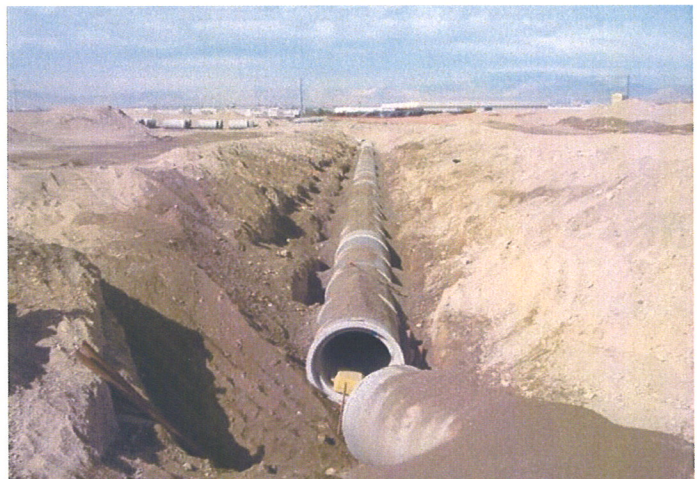
CAMU: RCP storm drain pipe installation.