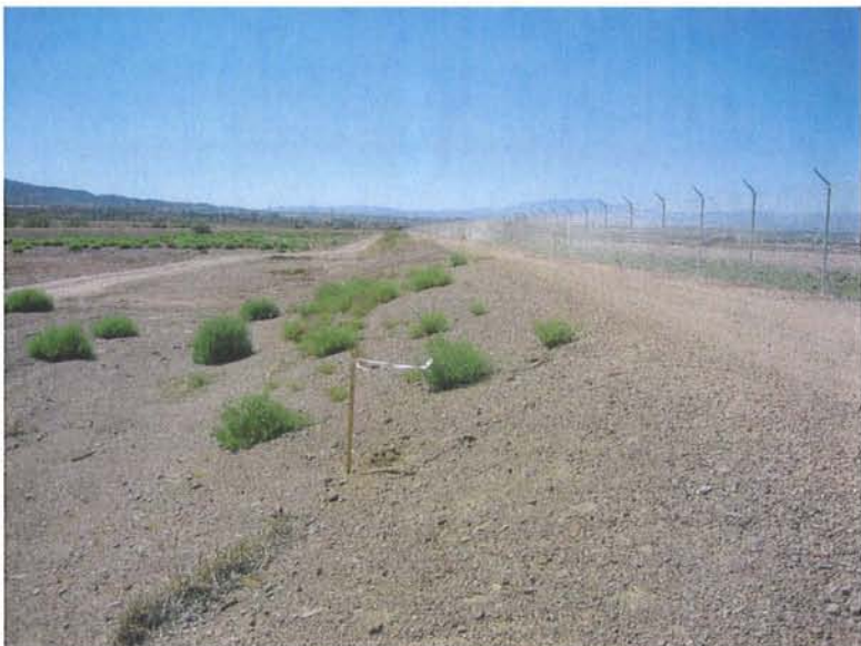
6. North Boundary (fence-line); View toward the west along the north boundary. Sample location SRC2-J21 is visible in the foreground.