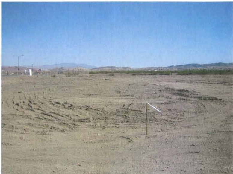
1. Area 1: View toward the east showing a portion of Area 1. Sample location SRC2-AH16W is visible in the foreground.