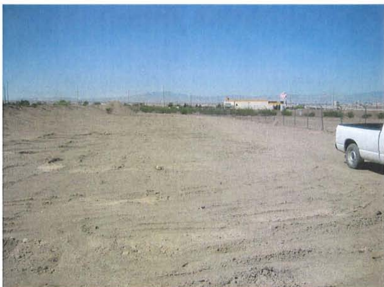
2. Area 2: View toward the west along the northwest portion of Area 2.