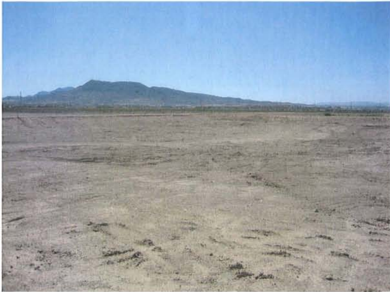
4. Area 4: View toward the southwest showing the northwest portion of Area 4. View is from the north boundary fence.