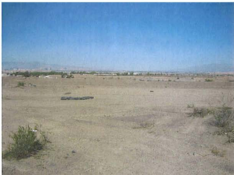
3. Area 3: View toward the north (from area 2) showing the southwest portion of Area 3).