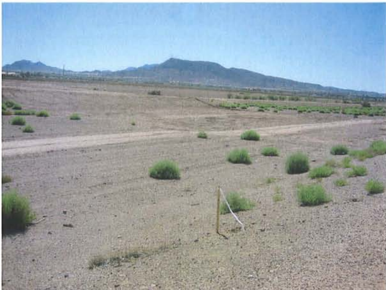
5. View showing the northwest portion of Area 4. Sample location SRC2-J21 is visible in the foreground.