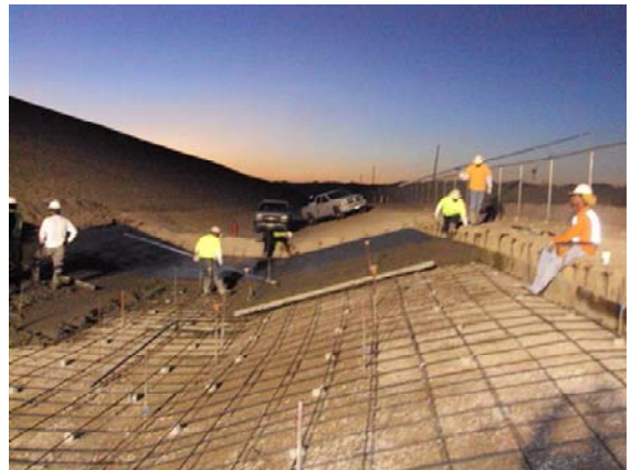
CAMU: South w est channel, first section concrete pour.