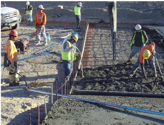
CAMU: South west channel, first section concrete pour.