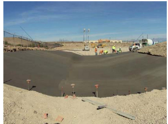
CAMU: South w est channel, first section concrete pour.