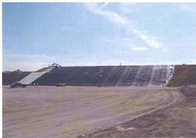
CAMU, Phase 1, End of East slope liner installation.