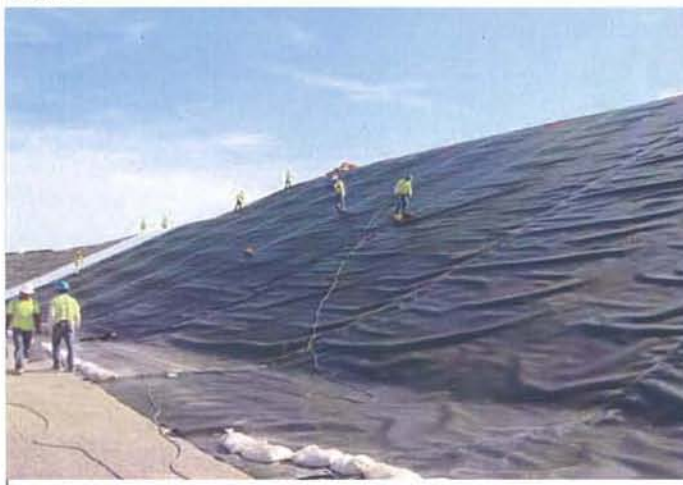
CAMU, Phase 1, Liner Crew Deploying liner on East Slope.