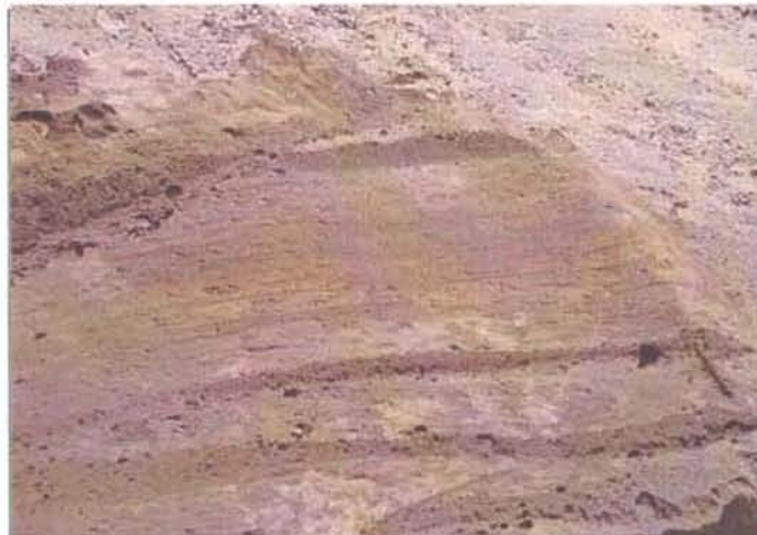
Eastside, SW-8 discolored soil after 10' additional excavation below liner.