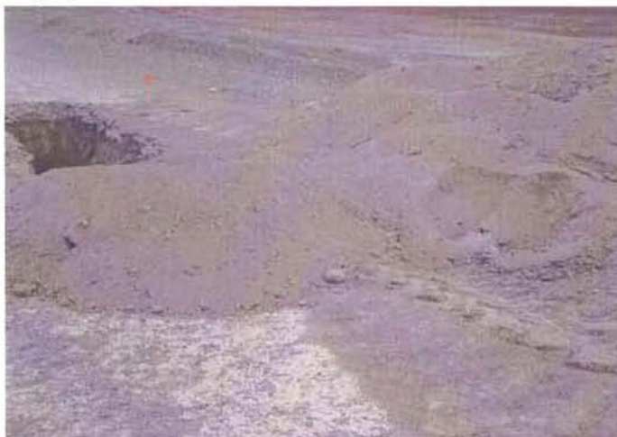
Northeast detention basin. Potholing excavations begun.