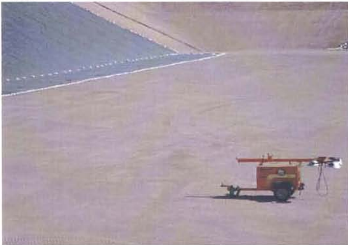
CAMU, Phase 1 Light plant for night work on floor.