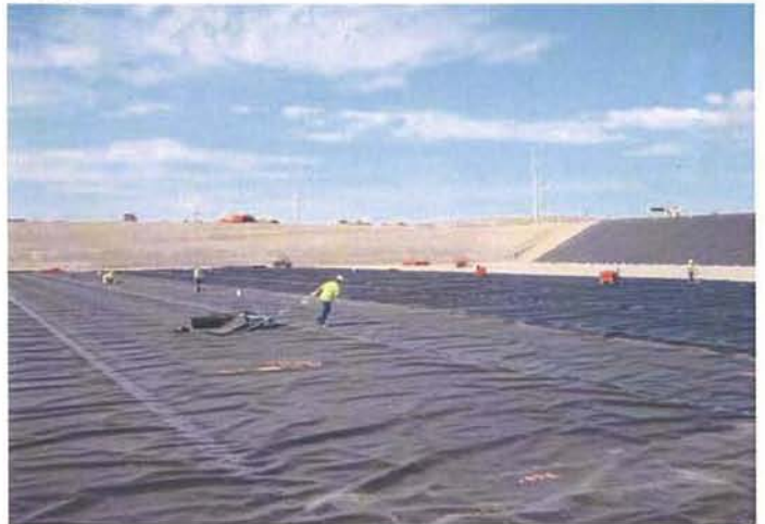
CAMU, Phase 1, Liner Crew performing housekeeping.