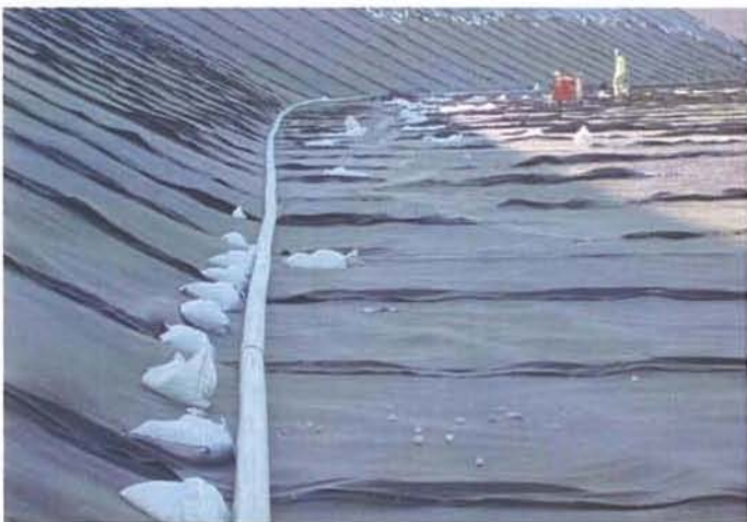
CAMU, Phase 1, 4" HDPE pipe being installed for LCRS system..