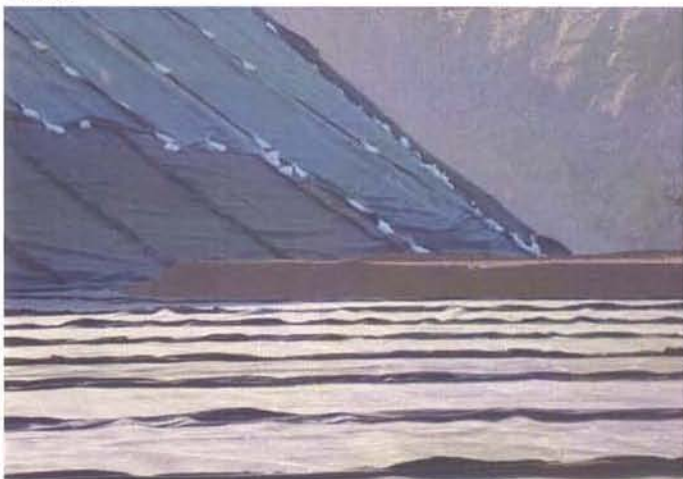
CAMU: Phase 1 Operations layer being placed.