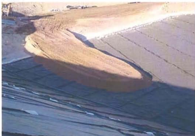
Phase 1 Operations layer placed on liner.