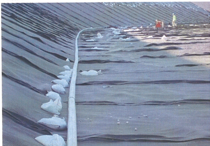
CAMU, Phase 1, 4" HDPE pipe being installed for LCERS system..