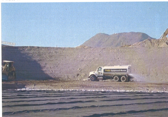
CAMU: Phase 1 Dust control for beginning of OPS Layer placement. Bottom of Ramp.