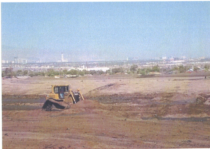
Eastside, SW-9, Wet and Dry soils being mixed and spread out to dry.