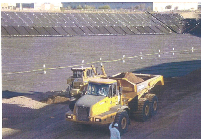
CAMU, Phase 1, Operation Layer truck being guided.