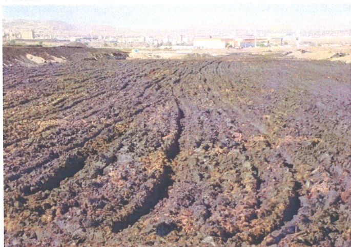
Eastside, HP-3. Wet soil disked and drying.