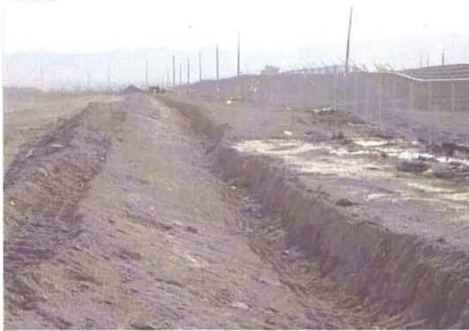
CAMU: Ditch on South side to stop run in to Phase 2.