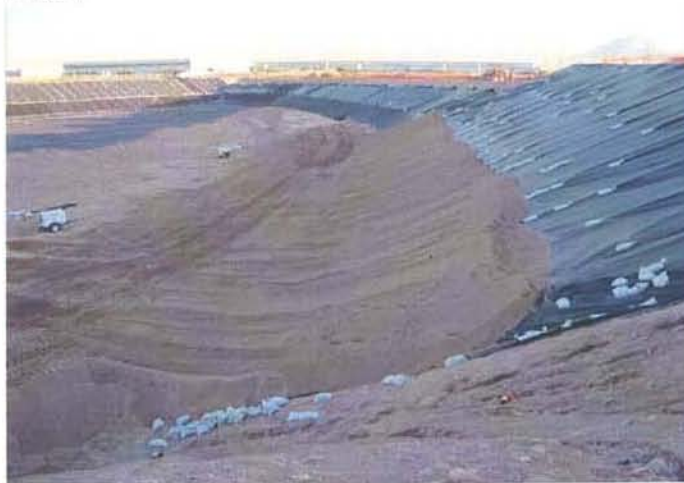
CAMU, Phase 1 East slope coverage of operations layer.