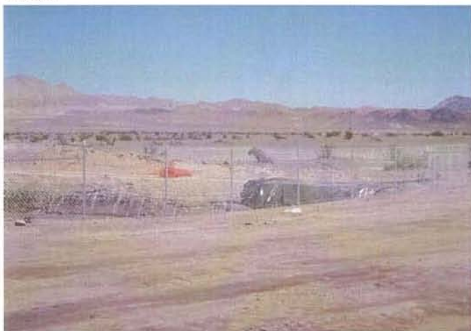
Eastside. Fence installation at crossroad sewer realignment.