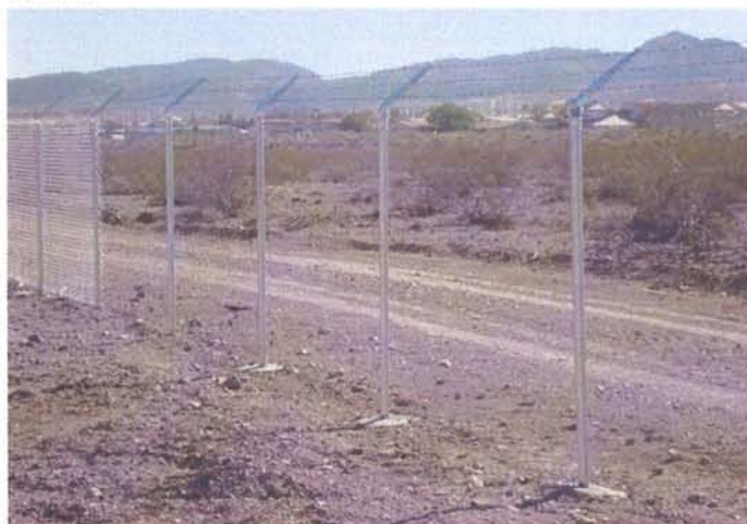
Eastside: Fence stolen Friday night 9-12-08. Southeast side.