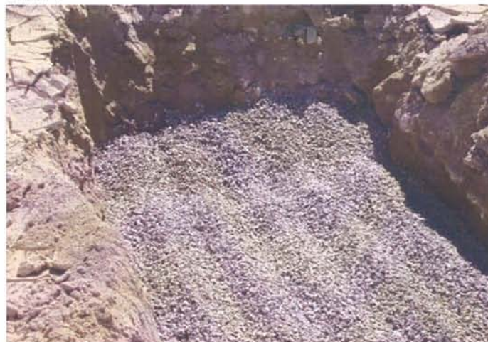
CAMU: Phase 2, potholes. Silt and sediment removed backfilled with rock above water level.