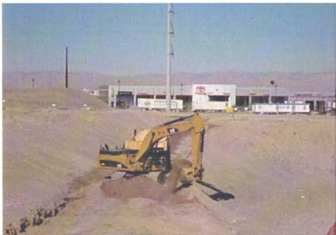
CAMU, Phase 1 scraping ramp of potentially contaminated soils.