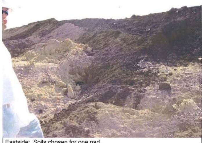
Eastside: Soils chosen for one pad.