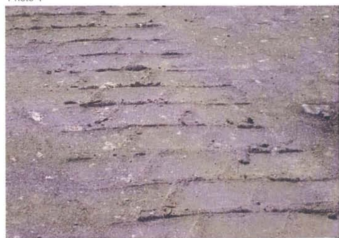
Eastside: Rutting was minor after 40 ton loaded dump truck backed on test pad.