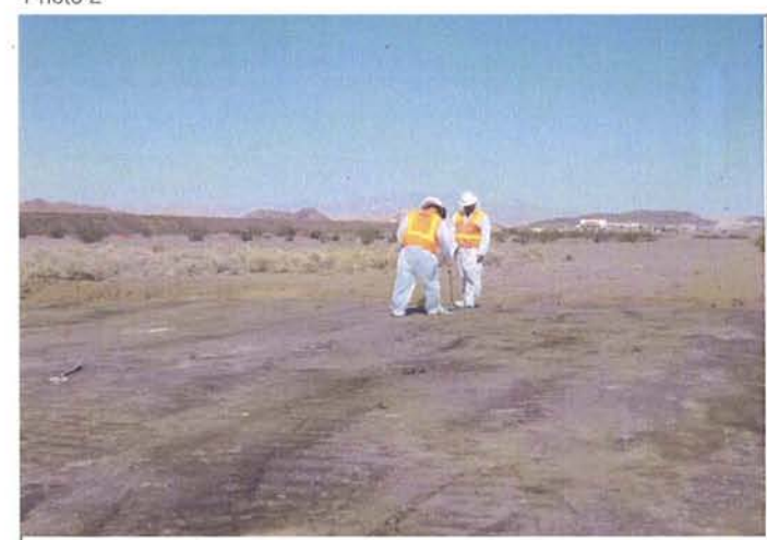
Eastside, Geosyntec performing compaction testing on test pads..