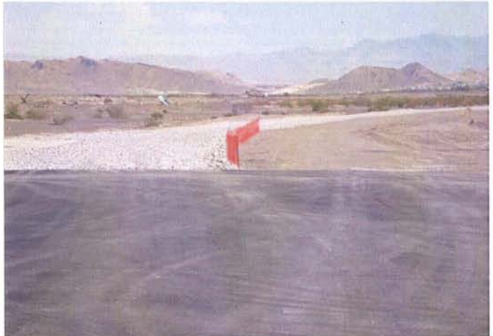
.Eastside: Pavement along with rock next to decon pad.