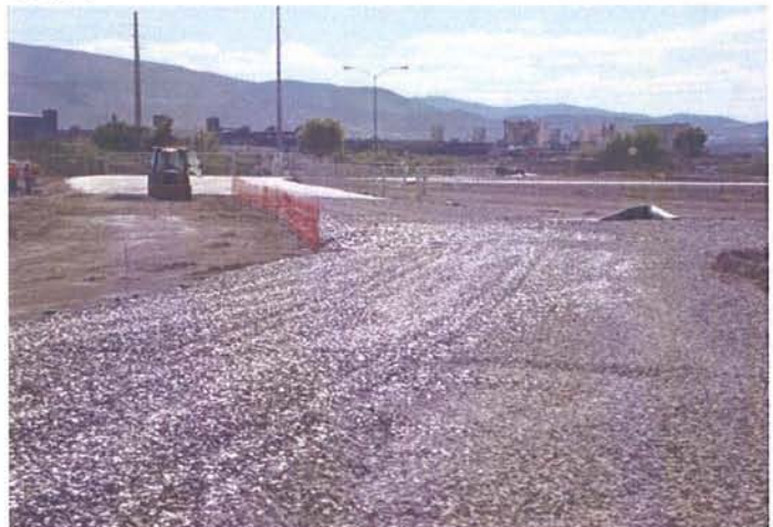
Eastside: View coming up to decon pad.