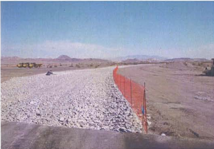
Eastside: trackrock and fence delineation ingress/egress.