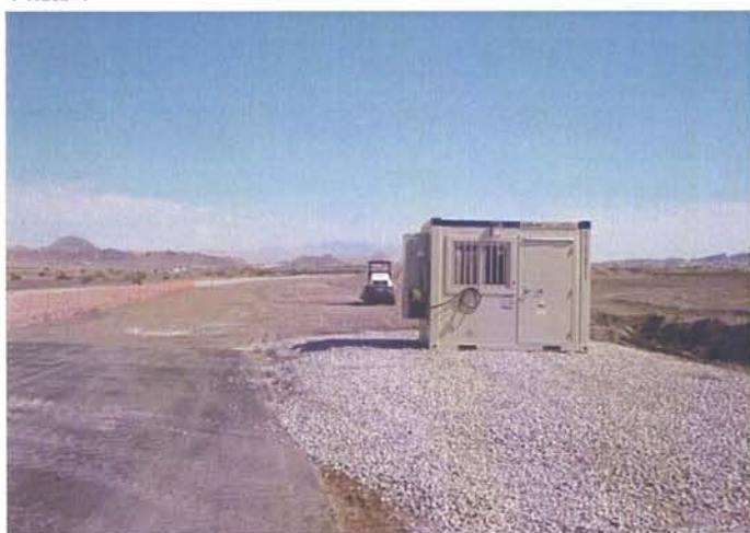
Eastside: Main entrance, security guard shack.