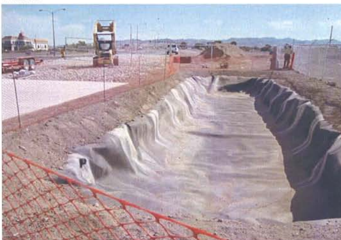
Westside support pond for decontamination pad.