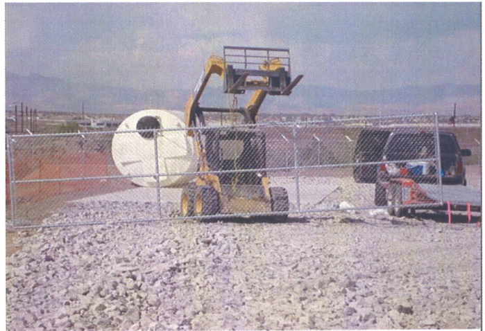
Westside: Setting part of Main Gate. At exit haul road.