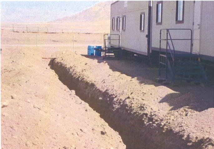
Eastside: Trenching excavated for electrical power..