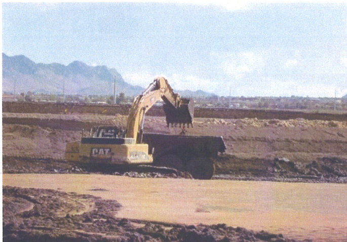
Eastside: Loading out wet soils from SW-10.