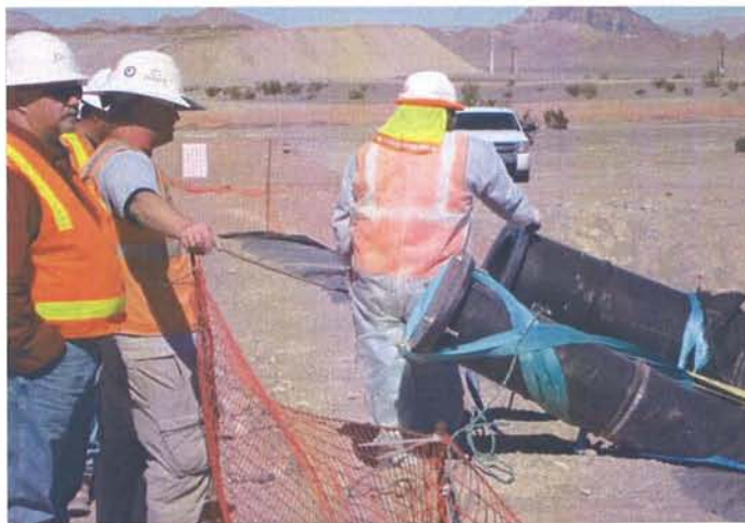
CAMU: Entact checked the sump in Phase 1 for water with pump. It was dry.