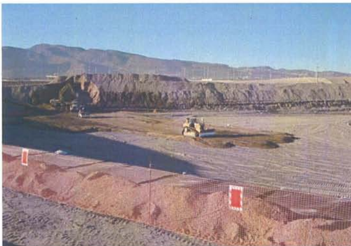
CAMU: Phase 1 hauling and placement of western ditch soils.