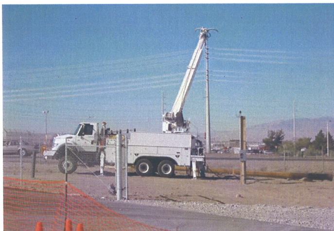
Eastside: Power poles installed.