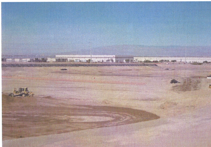
CAMU: Phase 2. Western ditch grading the floor.