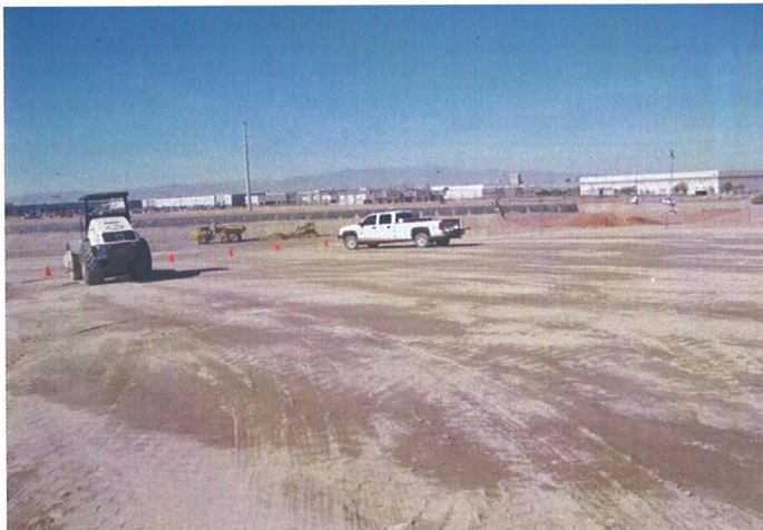
CAMU: Phase 1. Ramp, looking Northwest.