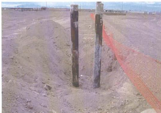
CAMU: Phase IIIA, closed well casing's to be cut 3 feet below liner subgrade.