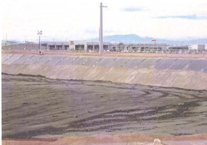
CAMU: Phase I, waste placement, Northwest end.