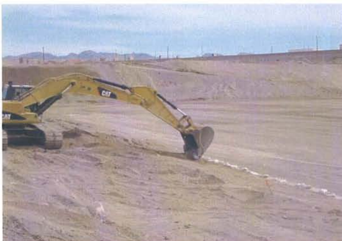
CAMU: Phase I, sloping off and preparing to expose end of liner.