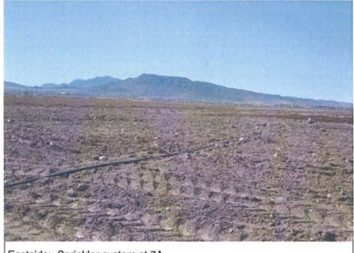
Eastside: Sprinkler system at 7A.