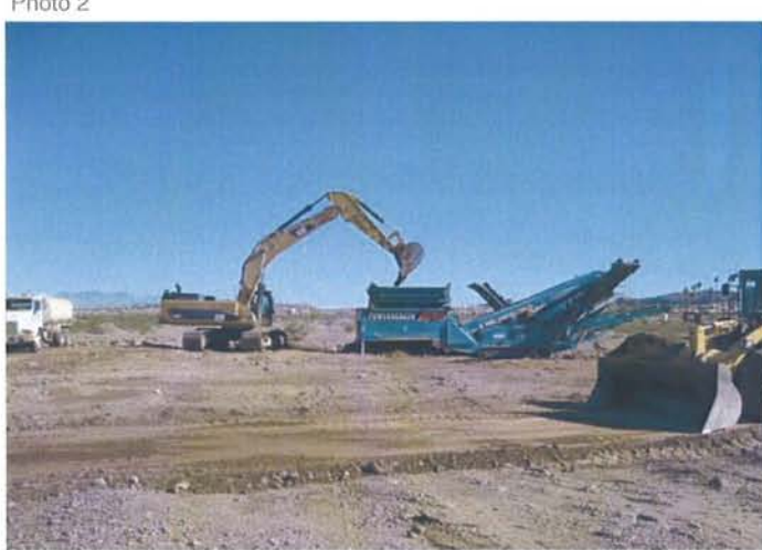
Eastside: Powerscreening in 7A.