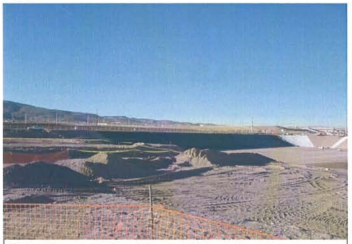
CAMU: Phase II, Southwest Liner installation continues.