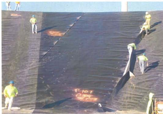
CAMU: Phase II Southwest corner panels # 54 & 55 out of spec, being replaced.