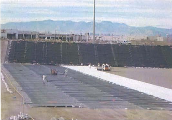
CAMU: Phase II, Western Ditch, west slope and floor.