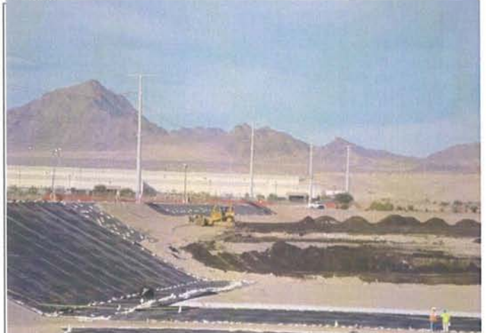
CAMU: Western ditch, west slope liner. Operations layer pushing up with spotter in phase I.