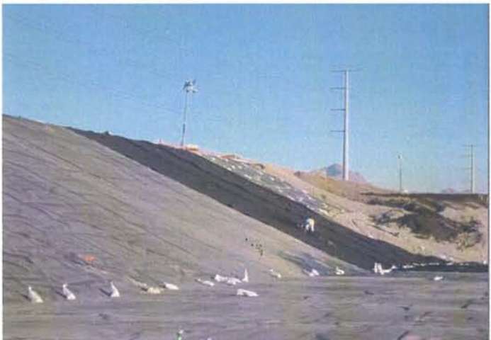
CAMU: Geocomposite installation west slope beginning Phase II.