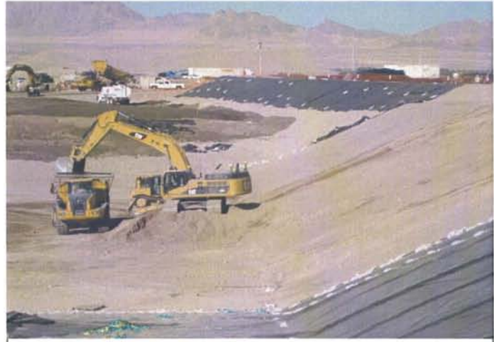
CAMU: Western ditch, east slope shaping and ramp removal.