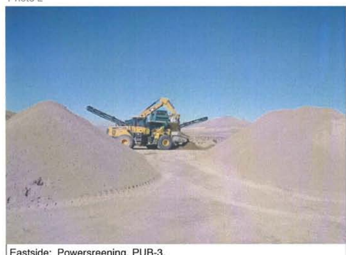
Eastside: Powersreening, PUB-3.