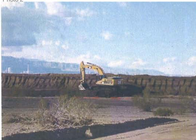
East Side: HP-3 stockpile