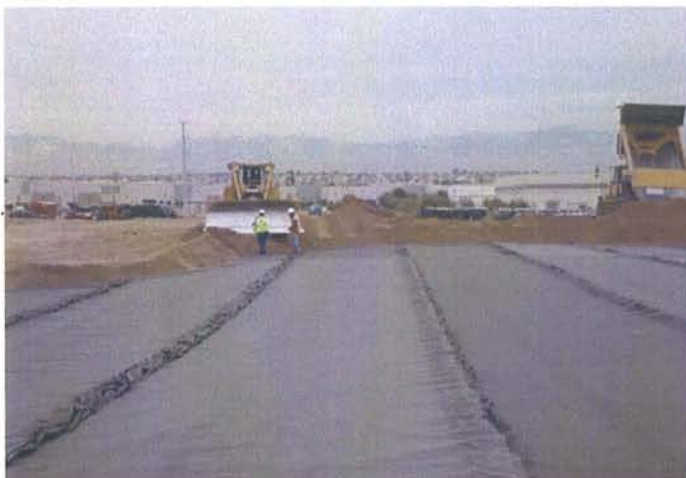
CAMU side: BMI North Landfill, first lift push-out