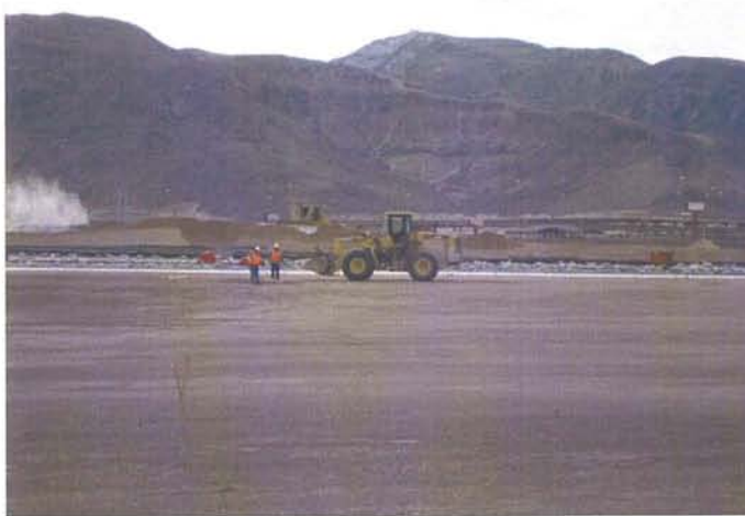
CAMU: BMI Landfill North, First lift push-out and sub-grade preparation.