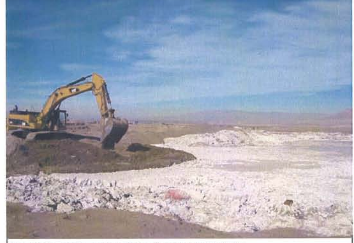
Eastside: SW-2, mixing dry soils with wet material.