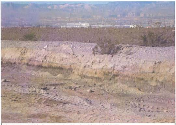
Eastside: PUC-4 contamination in sidewall North.