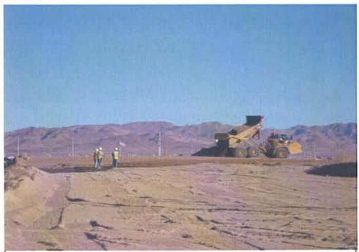
CAMU: North BMI Landfill, Entact, Geosyntec, and Weston monitoring the placement of 1" minus 12" layer on liner.