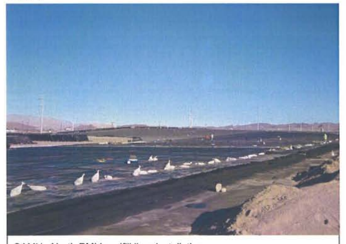
CAMU: North BMI Landfill liner installation.