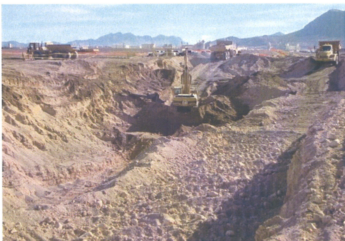
CAMU: NW Basin/Phase IIIB trench excavation.