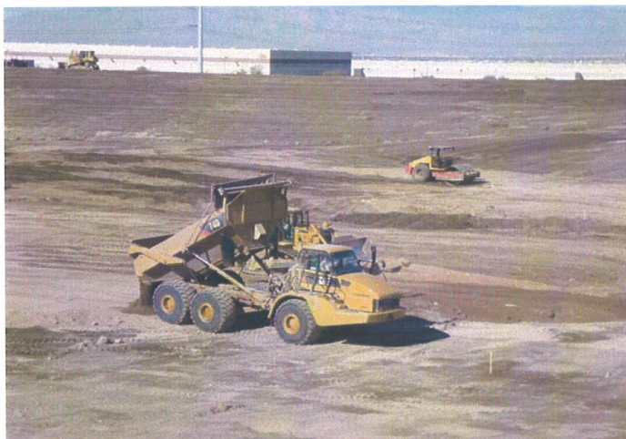
CAMU: Phase II Daily waste placement.