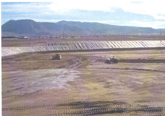
CAMU: Phase II Waste placement looking south.