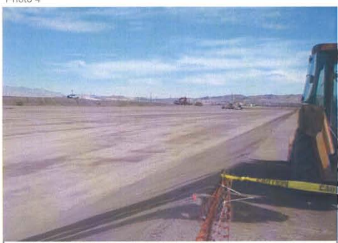
CAMU: Phase IIIA subgrade, looking east.