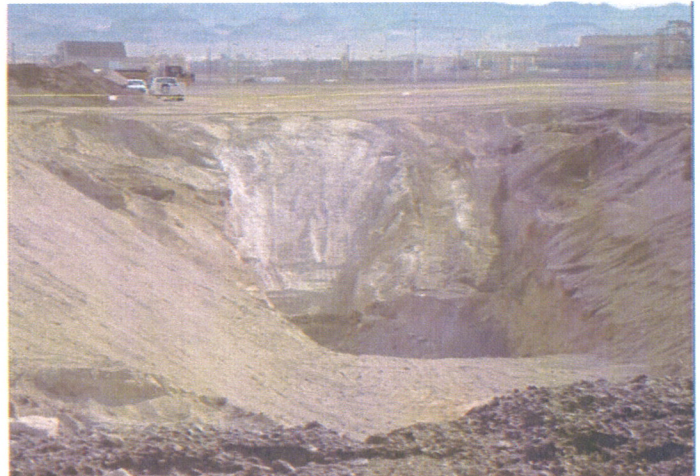
CAMU: Slit trench NW-1, looking east.