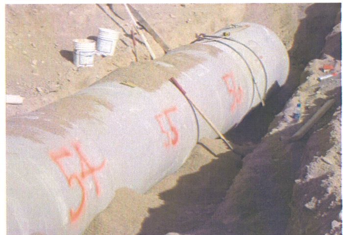
CAMU: 42" RCP, storm drain pipe system.