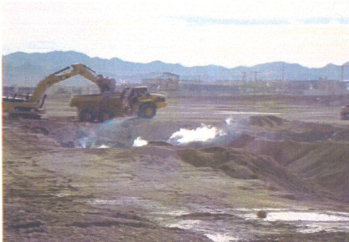
CAMU: Slit trench, NW-2.