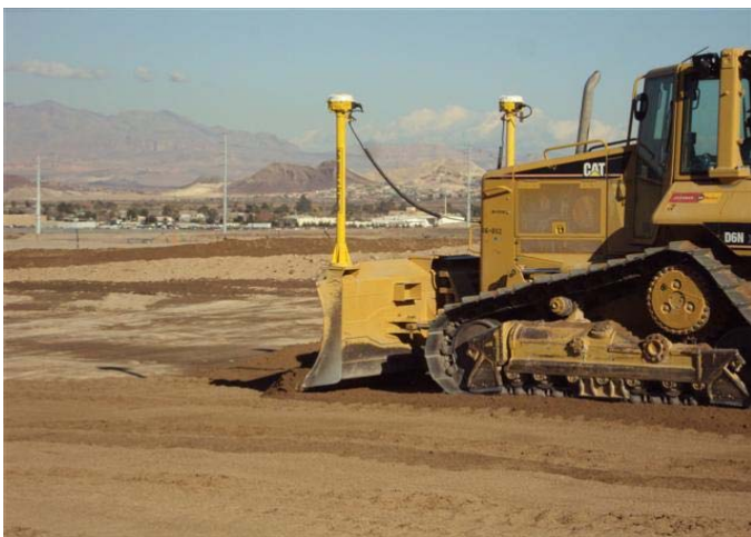
CAMU: Phase II, placing interim cover.