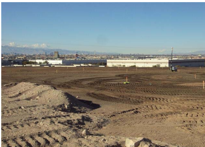
CAMU: Phase IIIB.