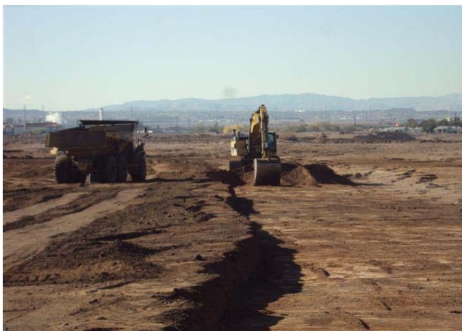
Eastside: Scraping SW Ponds.