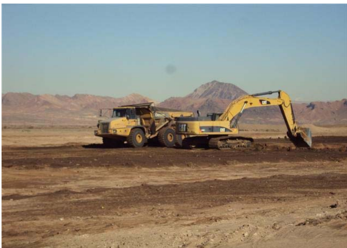
Eastside: Scraping SW Ponds.