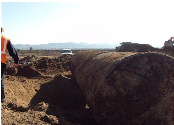
Eastside: Debris pile.