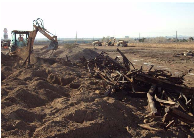
Eastside: Debris pile.