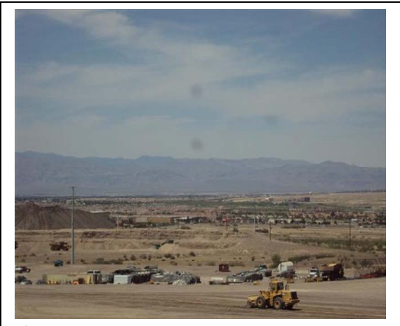
CAMU: BMI North, final grading.