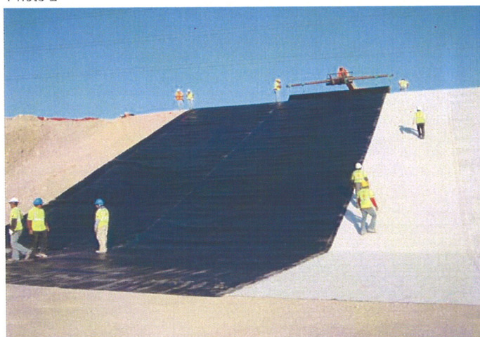
CAMU, Phase 1, Liner Crew Deploying 60 mil Geomembrane on West Slope.