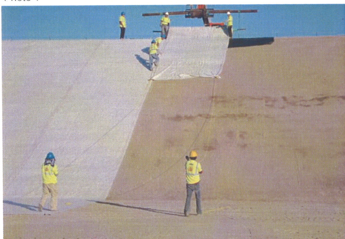
CAMU, Phase 1, Liner Crew deploying GCL on West Slope.