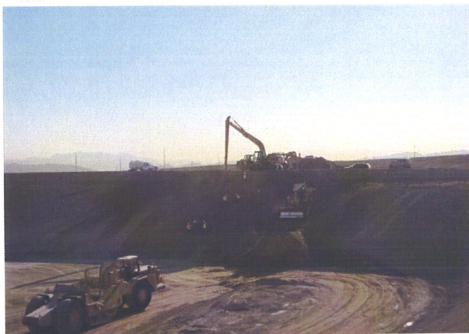
CAMU: Phase 1, East slope in preparation