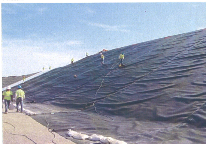
CAMU, Phase 1, Liner Crew Deploying liner on East Slope.