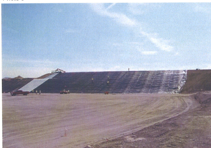
CAMU, Phase 1, End of East slope liner installation.