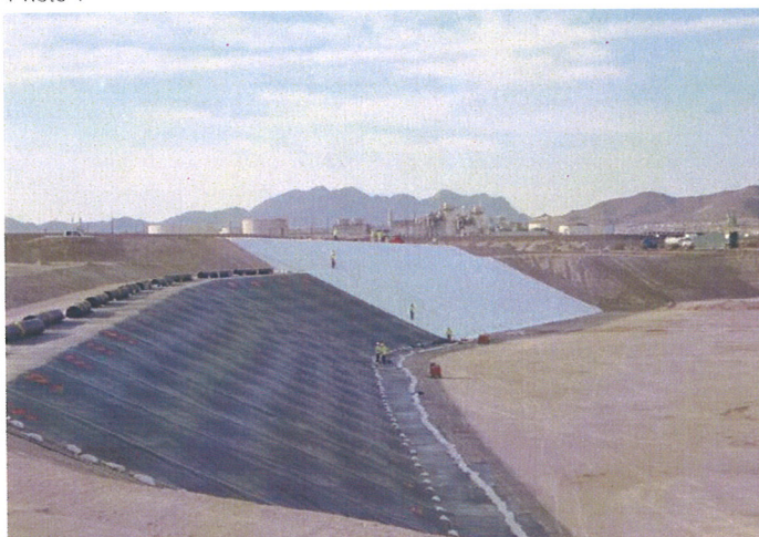
CAMU, Phase 1, East slope liner installation.