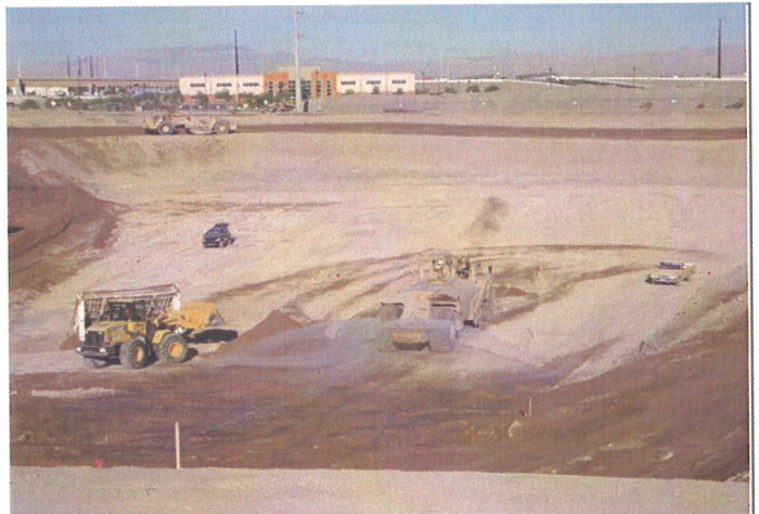
CAMU, Phase 2, slope excavation.