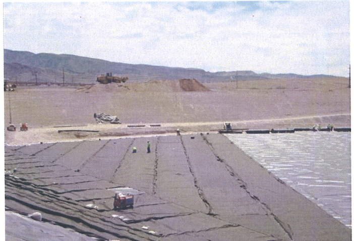
CAMU, Phase 1, beginning of geocomposite layer.