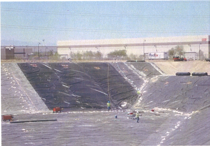
CAMU, Phase 1 liner completion of geomembrane.