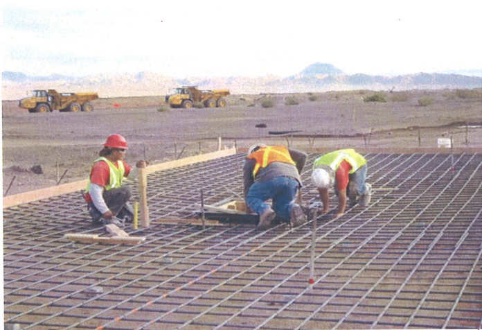
Eastside: Forming tying rebar setting drain sump for Decontamination Pad..