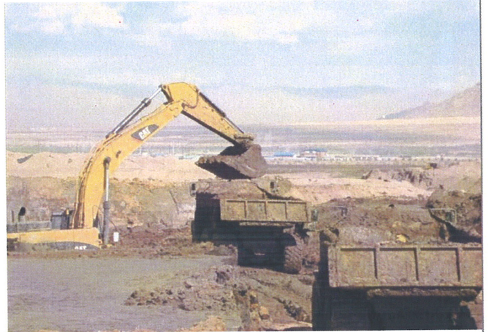
Eastside, Loading out wet soils SW-5 pond.