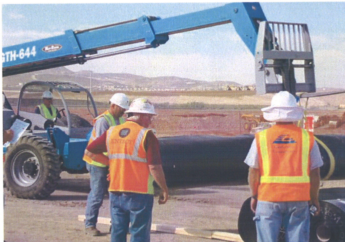
CAMU: Unloading liner and staging.