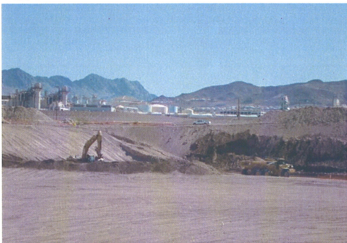
CAMU: Phase 1 preparation to haul western ditch soils.