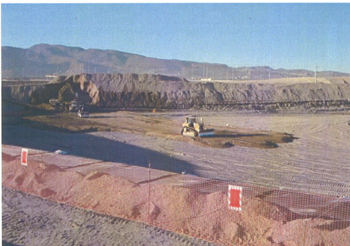
CAMU: Phase 1 hauling and placement of western ditch soils.