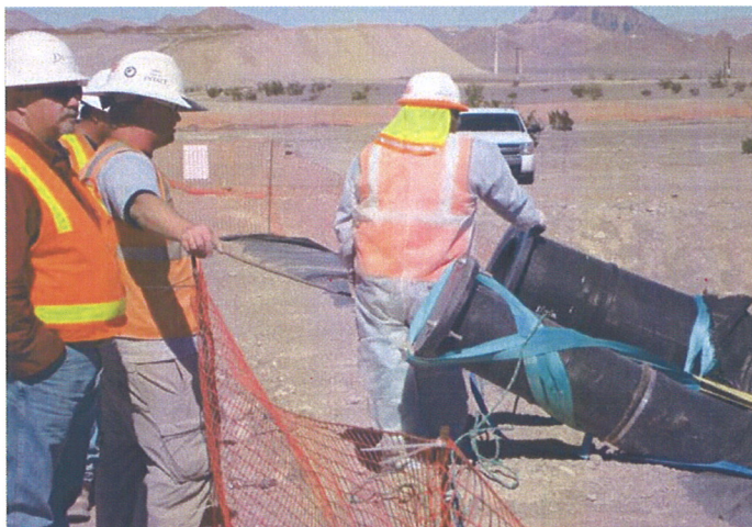
CAMU: Entact checked the sump in Phase 1 for water with pump. It was dry.