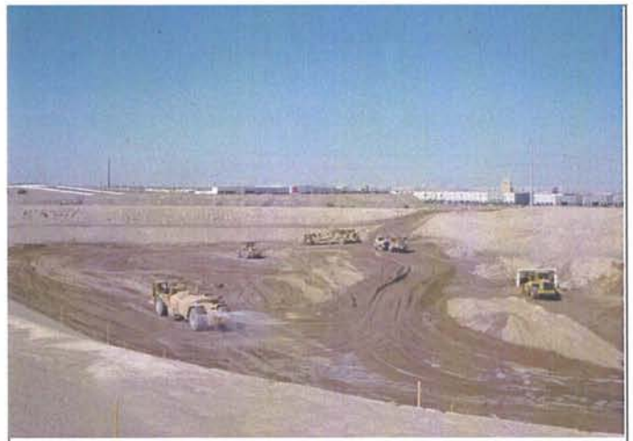
CAMU: Phase 2, placing lift of soil on floor, with dust control..