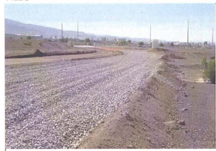
Eastside: Egress 1" cap rock approaching decontamination pad. Installed to assist in decon.of tires.