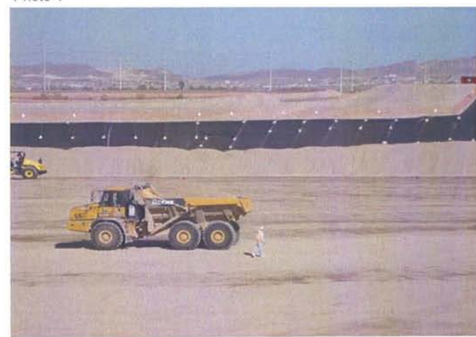
CAMU: Phase 1 Geosyntec monitoring proof rolling of lift with a loaded 40 ton haul truck...