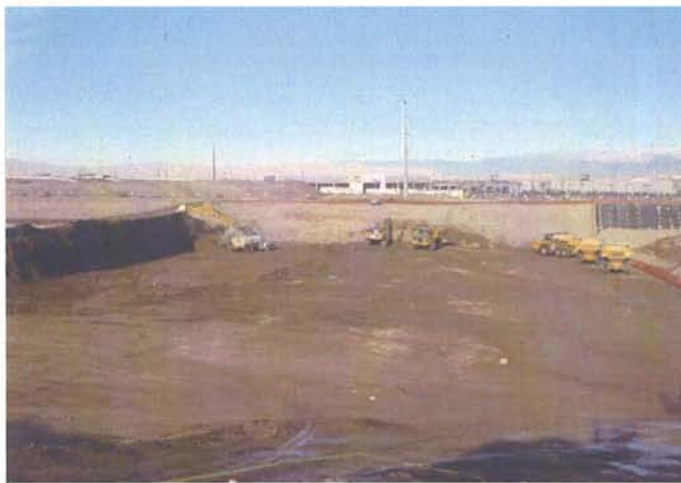
CAMU: Phase 1 western ditch soils finishing south wall.