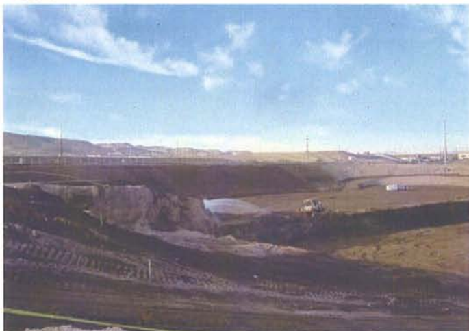
CAMU: View of Phase 2 on the other side of western ditch.