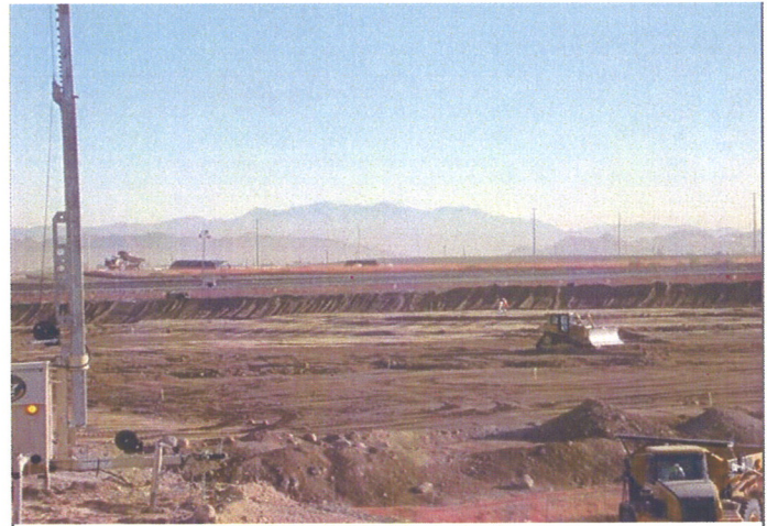
CAMU: Phase 1 operations layer , 1" minus placed on east slope.