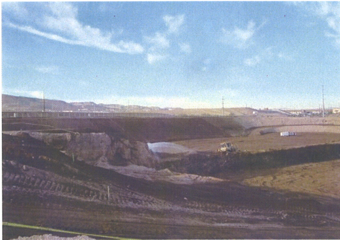
CAMU: View of Phase 2 on the other side of western ditch.