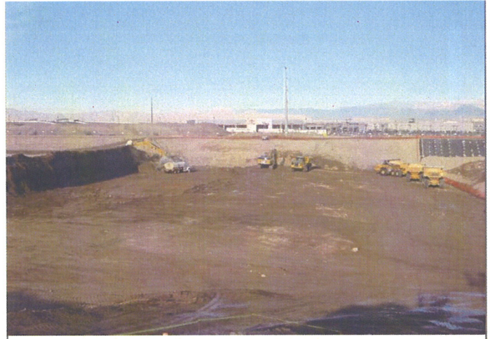
CAMU: Phase 1 western ditch soils finishing south wall.