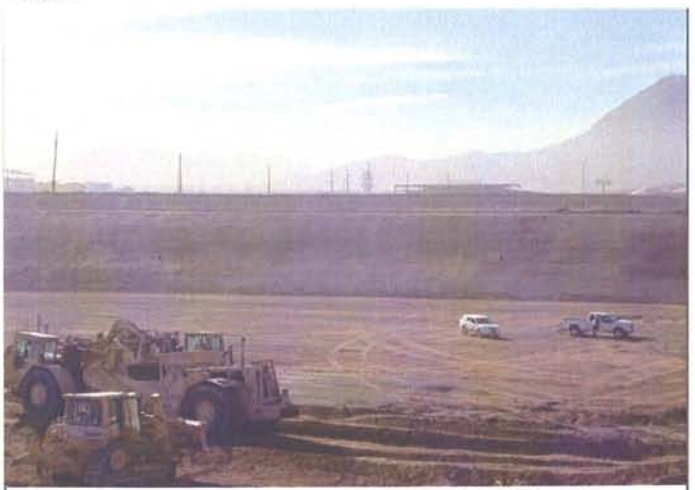
CAMU: Phase 2, Scrapers removing clean soil. Subgrade and southslope preparation.