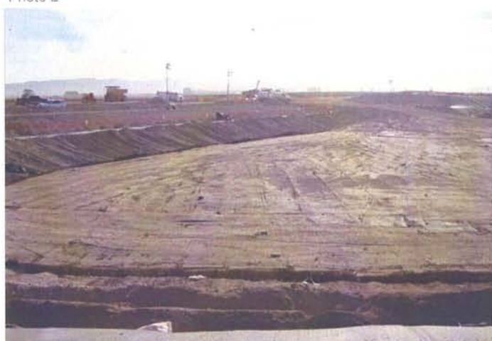
CAMU: Phase 1. waste placement. Looking east toward ramp.