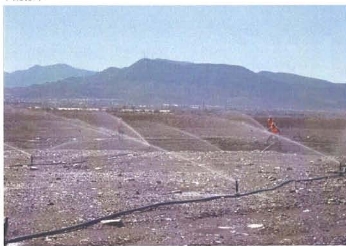
Eastside: Sprinkler System at 7A, dry ponds.