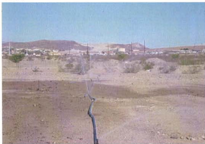
Eastside: Sprinkler System charged at 7A, dry ponds.