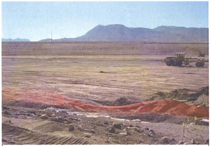
CAMU: Looking southeast western ditch and phase II floor phase II grading.