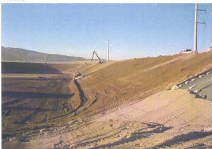
CAMU: West slope construction of western ditch portion of Phase II.