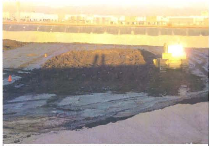
CAMU: Phase I area failed proofrolling test. Being reworked.