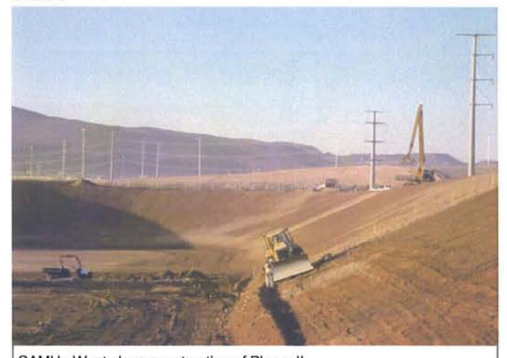
CAMU: West slope construction of Phase II.