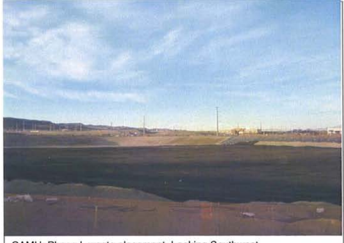
CAMU: Phase I, waste placement, Looking Southwest..