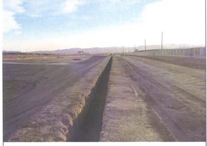
CAMU, Phase II, Anchor trench south end.