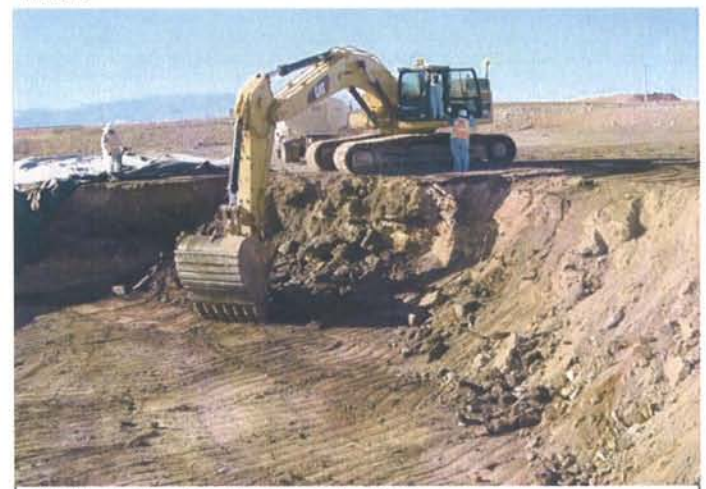
CAMU: Northeast Equilization Basin, Debri cleanup