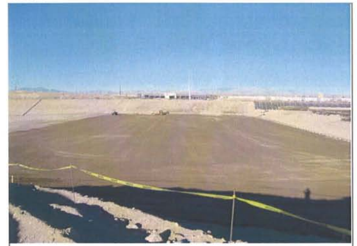
CAMU: Western ditch floor and west slope final grading and rolling..