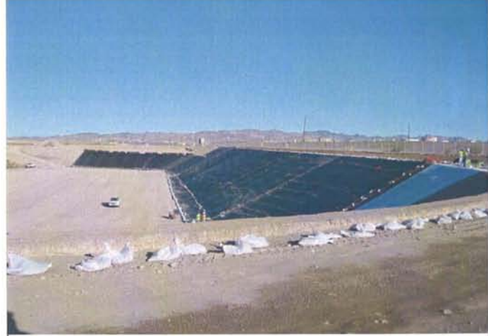
CAMU: Phase II, liner installation, beginning the southwest corner.