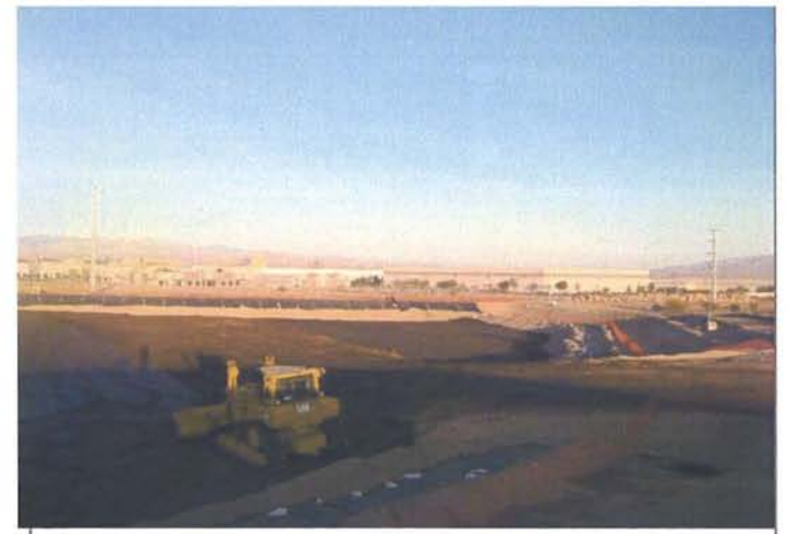
CAMU: Phase I, waste placement at dawn.