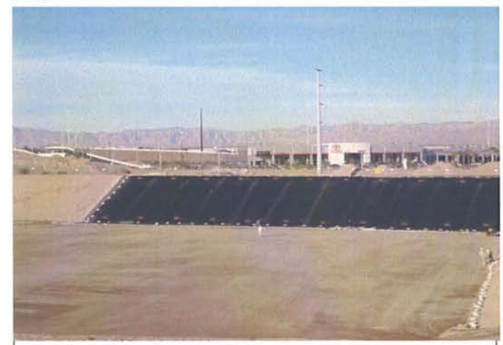
CAMU: Western ditch, west slope.