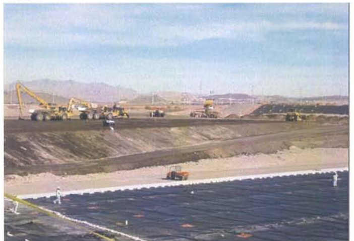
CAMU: Western ditch liner and Phase I ramp.