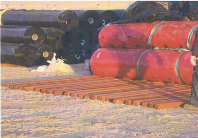
CAMU: Staging GCL liner rolls on (23) 4X4's.