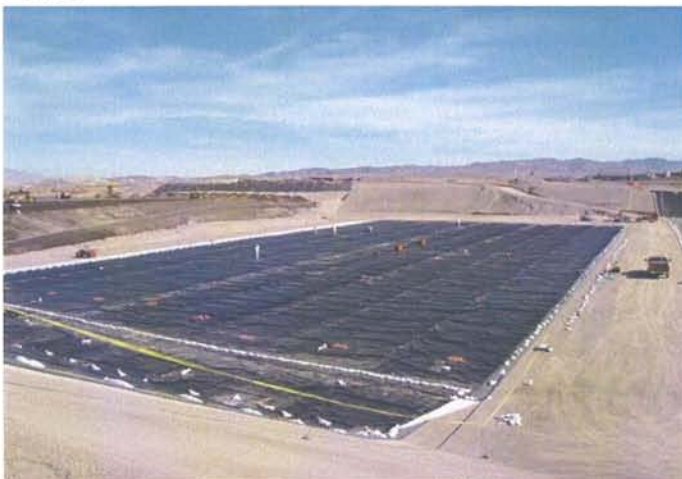
CAMU: Western ditch liner looking east.