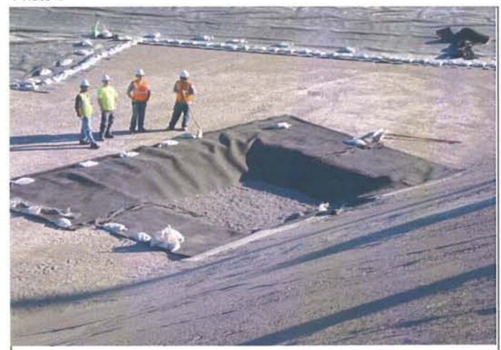
CAMU: Phase II, Vadose zone monitoring sump installed.