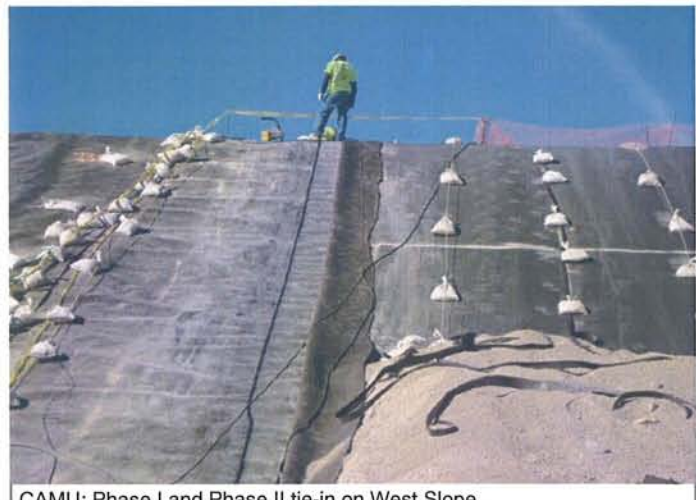
CAMU: Phase I and Phase II tie-in on West Slope.