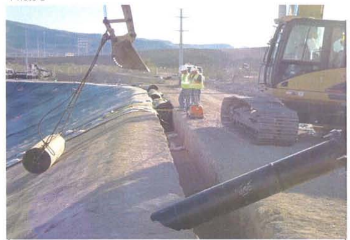
CAMU: Phase II, West slope rerake and roll after pipe installation.