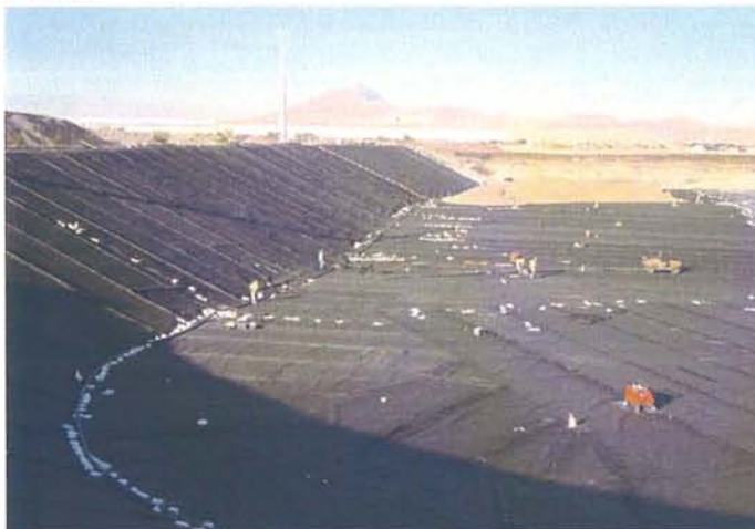
CAMU: Geocomposite installation and operations layer soils.