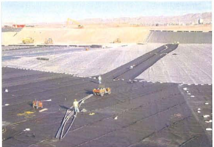
CAMU: Phase II, Southwest, welding HDPE LCRS drainage pipe.