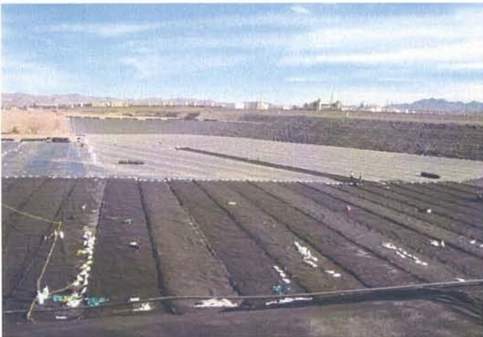
CAMU: Geocomposite and HDPE LCRS pipe installation.