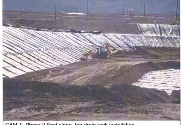
CAMU: Phase II East slope, toe drain rock installation.