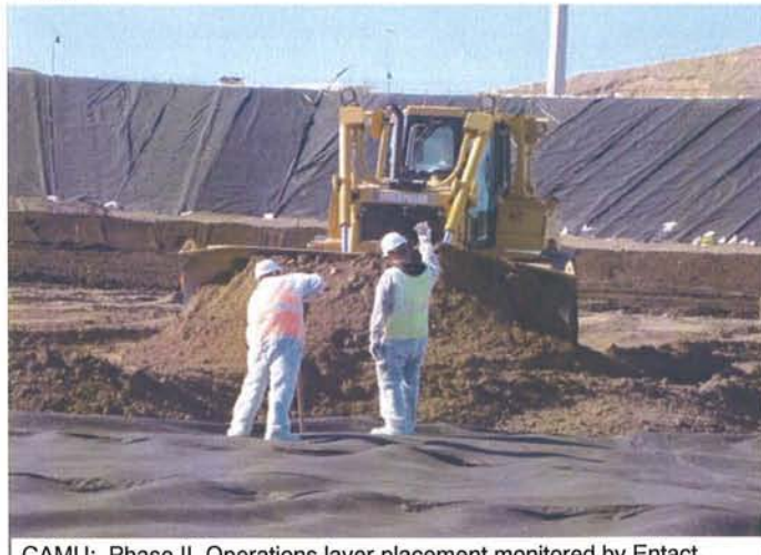
CAMU: Phase II, Operations layer placement monitored by Entact, Geosyntec and Weston.