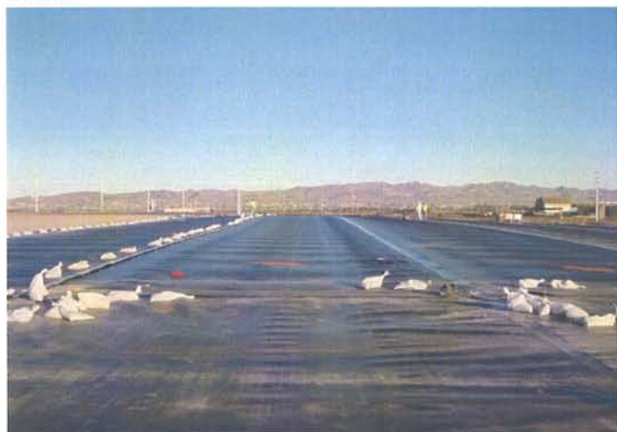
CAMU: BMI North Landfill Liner deployment, looking east.