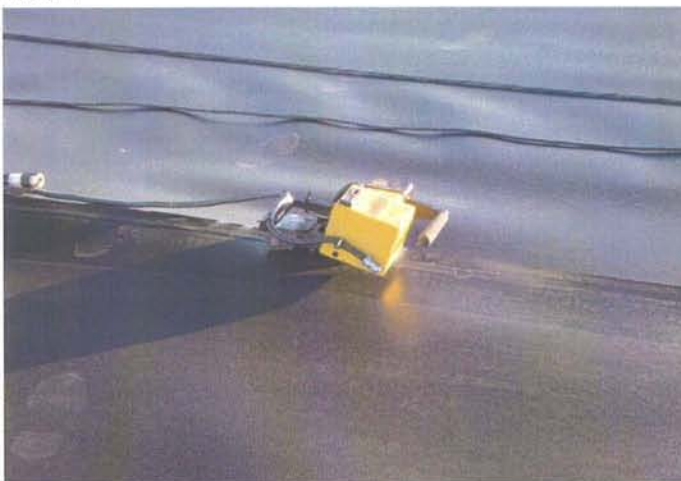
CAMU: BMI North Landfill Liner deployment welding a seam.