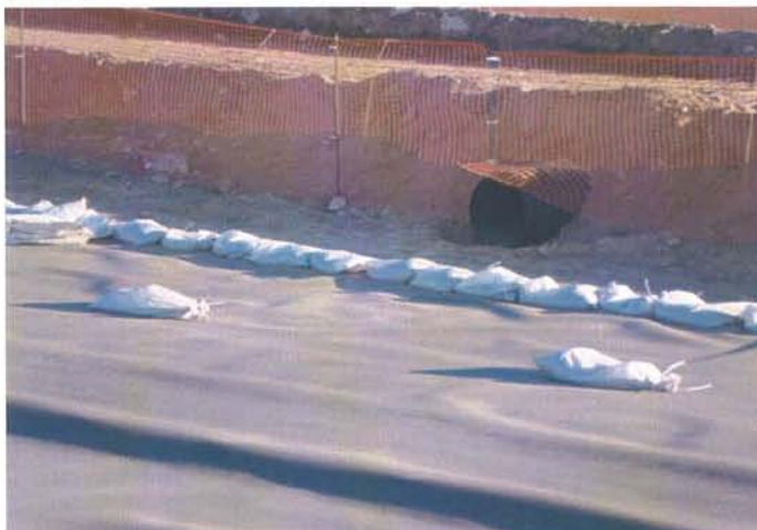
CAMU: BMI North Landfill south end installed (2) culverts to divert water buildup in the event of rain.